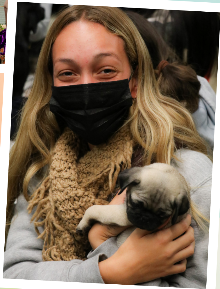
Puppies during finals week!!

In addition to many other school dances, every year right before Prom, Louisville will host MORP (Prom backwards). It is so funny to see everyone come dressed in their crazy outfits.