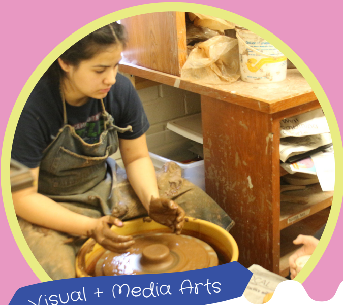
Visual + Media Arts

Explore your passion by creating works of art through drawing, painting, sculpting, photography, film and even computer graphics! Each year, Louisville students display their work not only on campus, but also throughout the city at various art exhibits and competitions. Not to mention, you are constantly surrounded by nature here on our gorgeous campus - how could you not be inspired?!